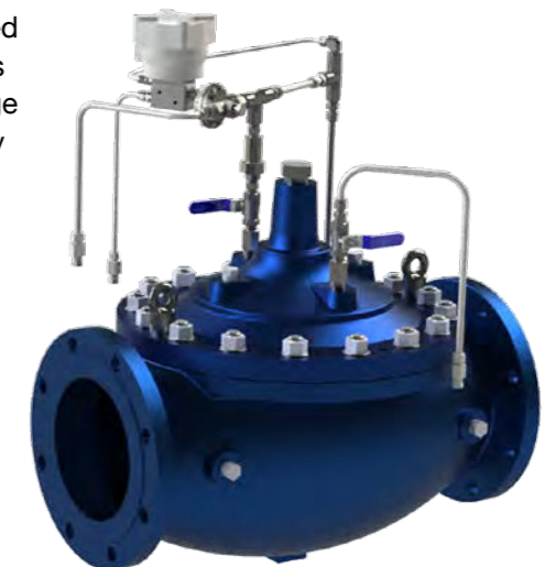
High Capacity Solenoid Valve

ACVs are used extensively in water distribution systems for maintaining water levels, pressures, flow rates and protection of pipe work and equipment.