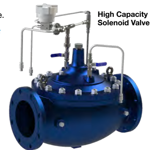
High Capacity Solenoid Valve

Mack solenoid-controlled Automatic Control Valves are available with a range of three-way or two-way solenoid pilot valves of various voltages, and open or closed when energised.